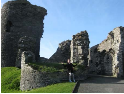
Aberystwyth Castle ruins