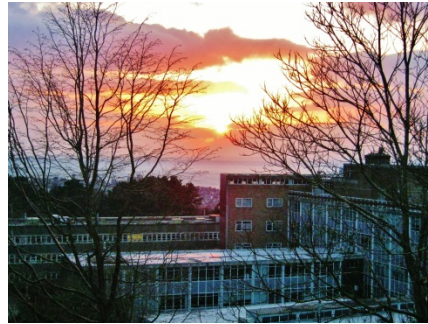
University of Aberystwyth campus

I had planned to travel around Europe over Easter Break with friends that I made in Aber, but I ended up getting appendicitis right before the break started, and needed emergency surgery. That was a huge, terrifying shock, but it all turned out well. I called the 24-hour residence helpline and had the porters drive me to the hospital where I was cared for very well. My insurance company didn't even get charged for the surgery, it was completely free since I was a resident of Wales! I even had time after my recovery to enjoy a fun-filled week in Ireland with two fellow exchange student friends.