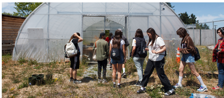
Photo: Mini-U campers learning on the land.