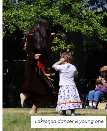
Lakw'agan dancer & young one