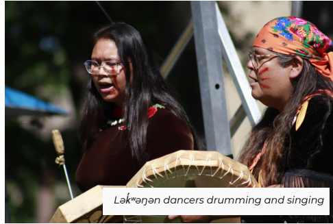
Lakw'agan dancers drumming and singing