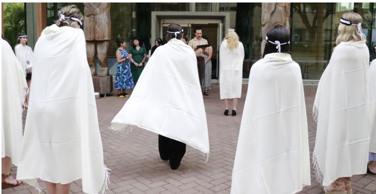
Photo: IRC Spring graduates

We are seeing an increase of graduates every year! As a result we hosted the IRC over 3 evenings to celebrate the 63 registered graduates from 8 different faculties with their family, friends and special guests.