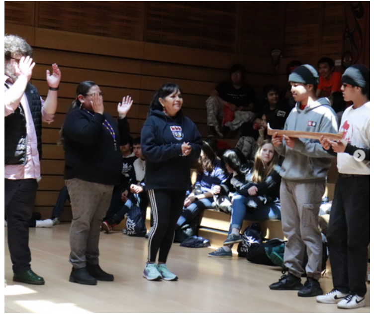
Photo: WSÁNEĆ students gifting a carved canoe to IACE.

We hope that your visit had a positive impact on your students and that we see them here again in the future.