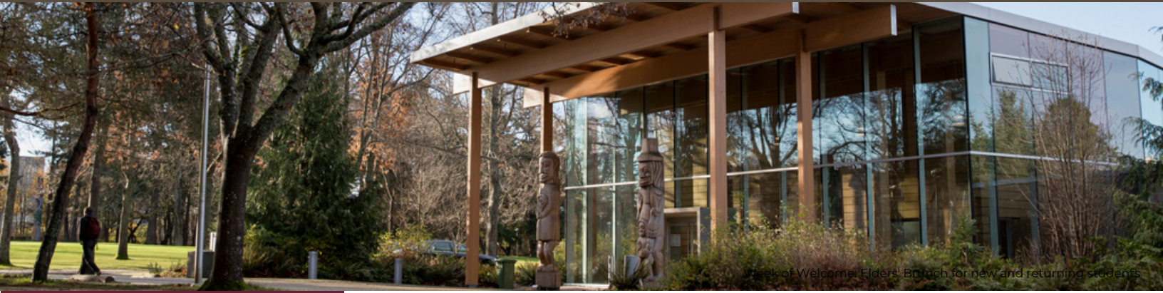
Words of Welcome: Elders' Blessing for new and returning students