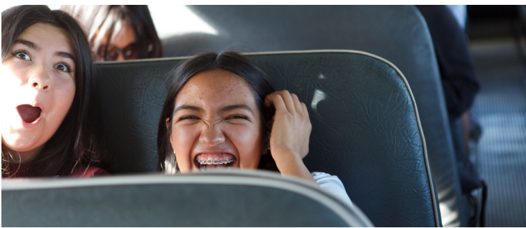
Photo: Mini-U campers on their way to a workshop.