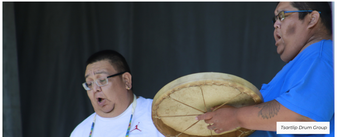
Tsartlip Drum Group