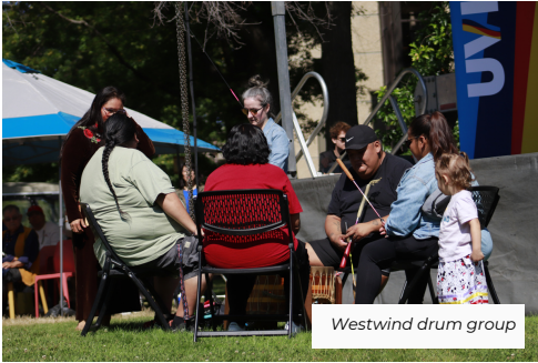
Westwind drum group