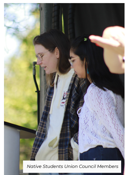
Native Students Union Council Members