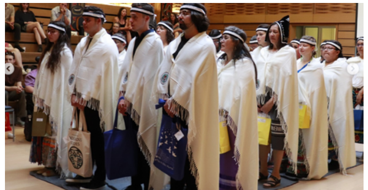
Photo: Indigenous graduates who have been blanketed and gifted.