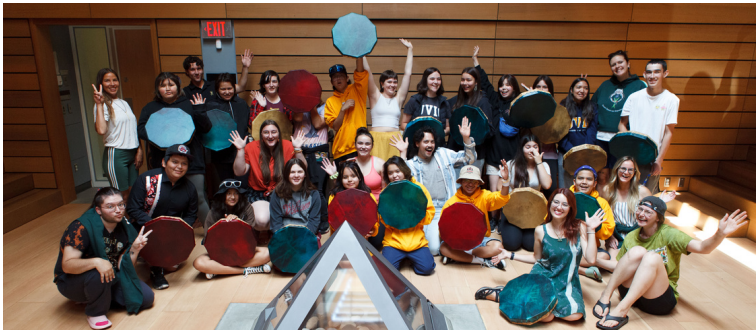
Photo: Group shot of Mini-U campers after drum making workshop.

"The workshops were always engaging and interesting for the youth. The cultural workshops were amazing because the youth could get help from Elders, as well as their fellow students. This camp is an amazing family, where we learn from everyone." - Chaperone