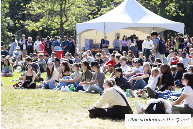
UVic students in the Quad