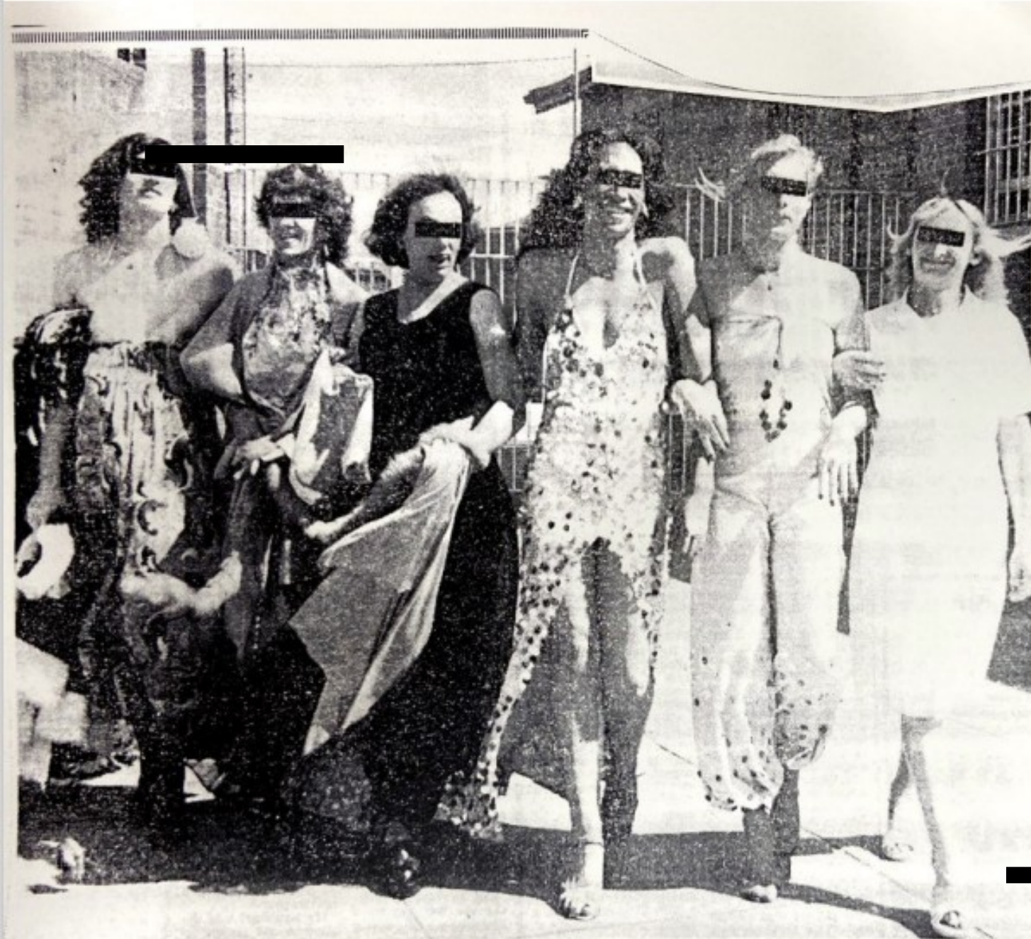
Six of the 13 prisoners who have undertaken sex change therapy, pictured in a yard at Long Bay Jail. One of the six was released from prison last year.