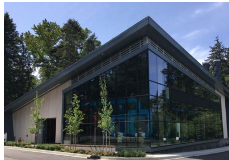
The new District Energy Plant is scheduled to be operational in 2019.

In 2018, UVic neared completion of a new District Energy Plant. The plant will allow for the decommissioning of three older, less efficient, plants on campus. New energy transfer stations are being installed throughout the district energy system and high temperature loads will be removed from the system. In total, these changes will allow UVic to reduce the temperature of the district energy loop and decrease the system wide emissions by approximately 700 tCO 2 e annually.