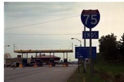
The border crossing to SS Marie, Ontario

Happy Back to School! Enjoy the journey the new school year brings!