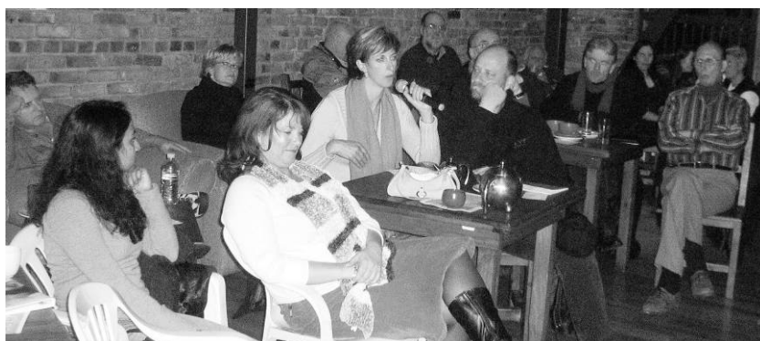
Scenes from Café Philosophy