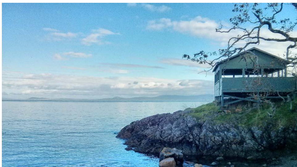
Left: The view from one of QACCH's nature trails.