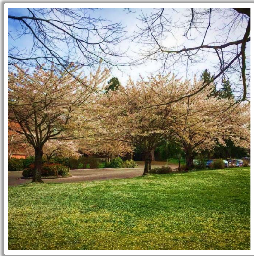
Above: Spring at UVic