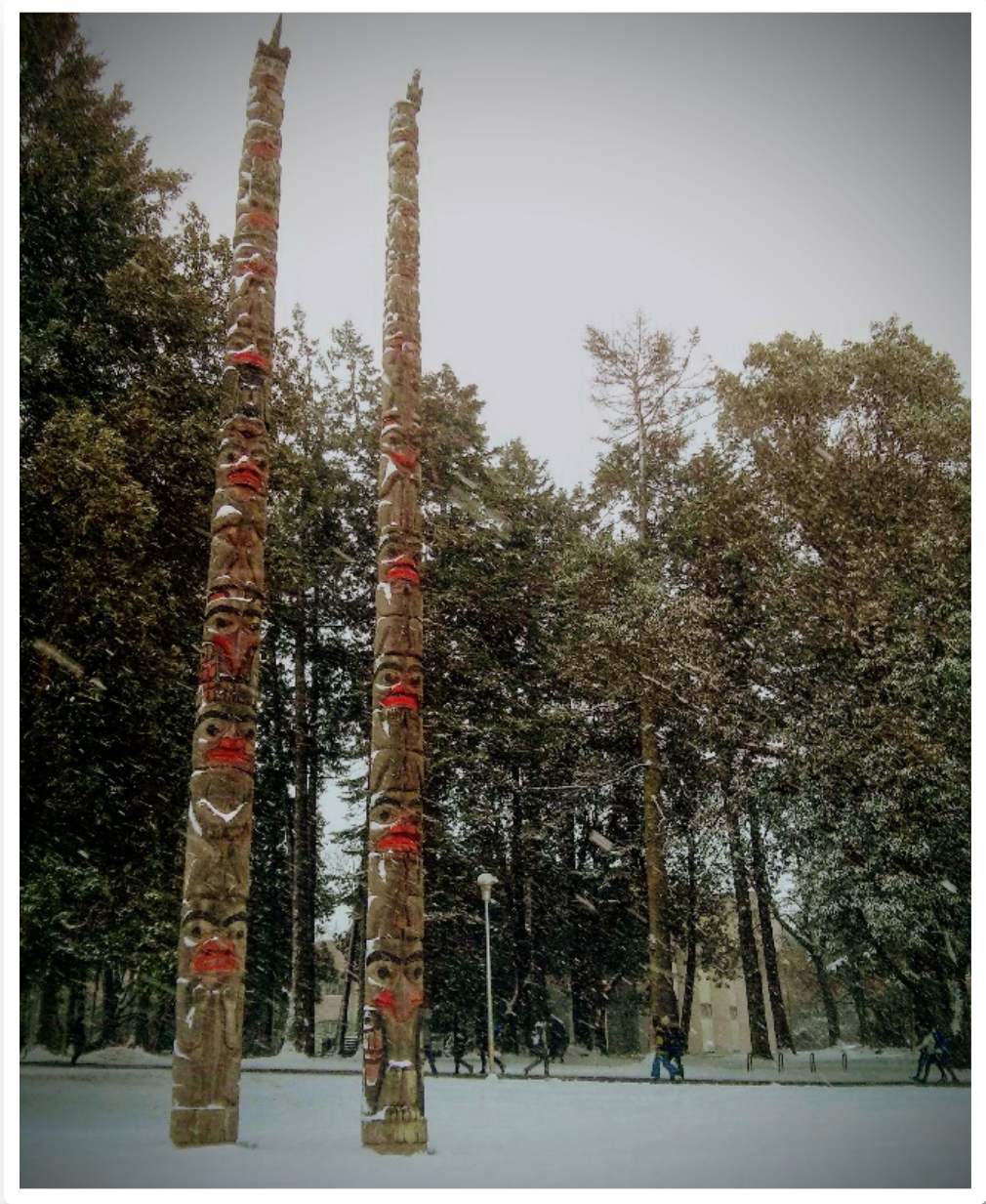
Above: UVic covered in snow!