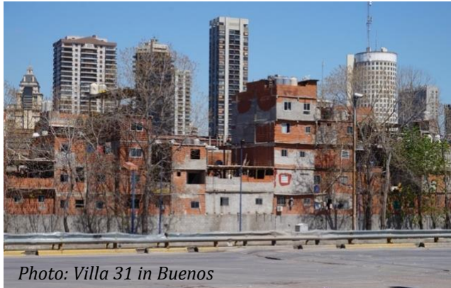
Photo: Villa 31 in Buenos