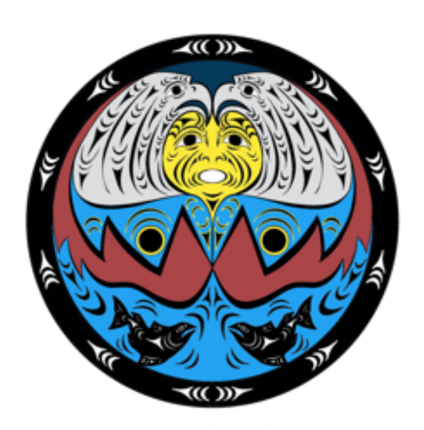
XAXE TTE SÉÅ, LTE TEYEY. XAXE TTE SÉÅ, LTE SÉÅL – Our land is socred. Our language is sacred. Artwork by Duvid Underwood (2018).

https://www.uvic.ca/services/indigenous/students/programming/elders/index.php