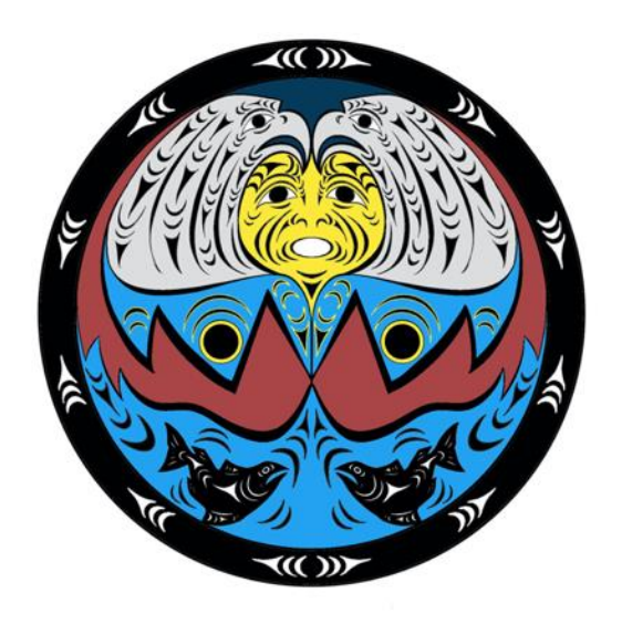
XAXE TTE SE\acute{A} , ŁTE TENEW. XAXE TTE SE\acute{A} , ŁTE S\acute{K}\acute{A}L – Our land is sacred. Our language is sacred. Artwork by David Underwood (2018).

https://www.uvic.ca/services/indigenous/students/programming/elders/index.php