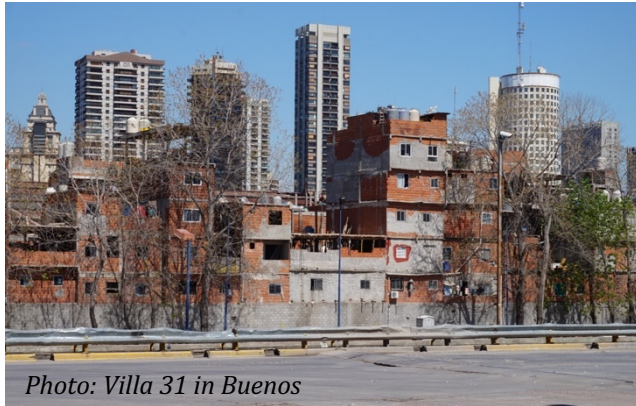
Photo: Villa 31 in Buenos