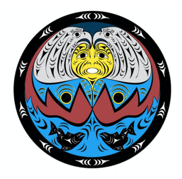
XAXE TTE SEÁ, LTE TENEW. XAXE TTE SEÁ, LTE SKÁL - Our land is sacred. Our language

https://www.uvic.ca/services/indigenous/students/programming/elders/index.php