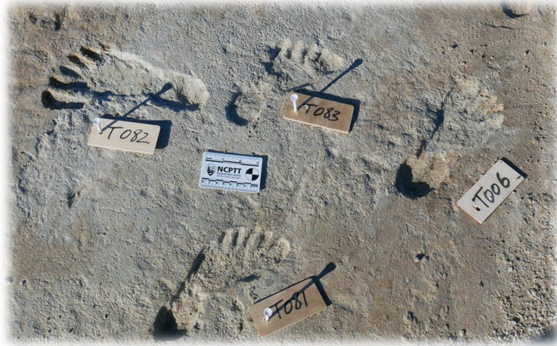
Footprints in New Mexico are oldest evidence of humans in the Americas