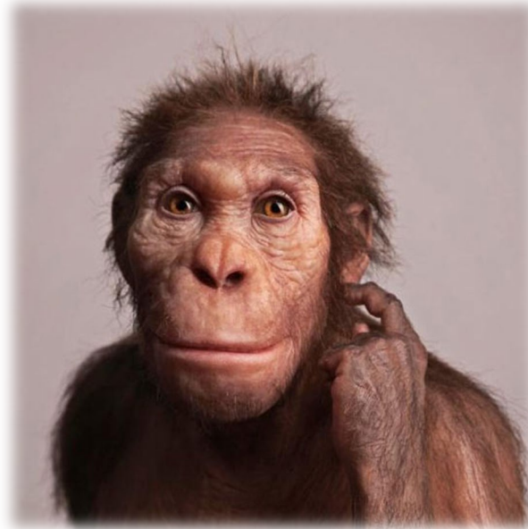
Australopithecus sediba Comfortably Walked on Two Legs, But Could Climb Like Ape