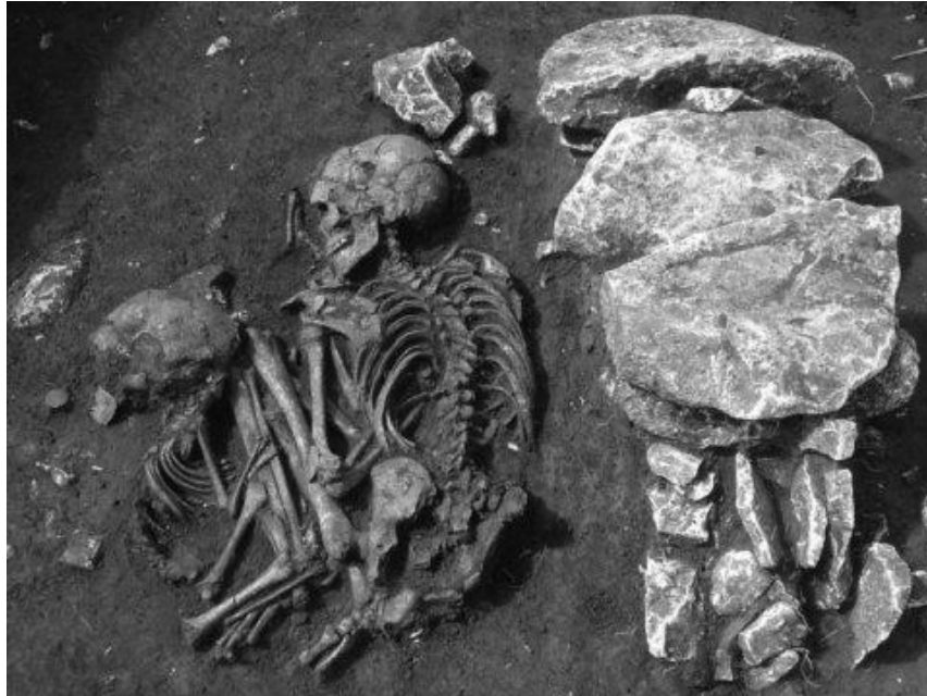
Prehistoric human migration in Europe