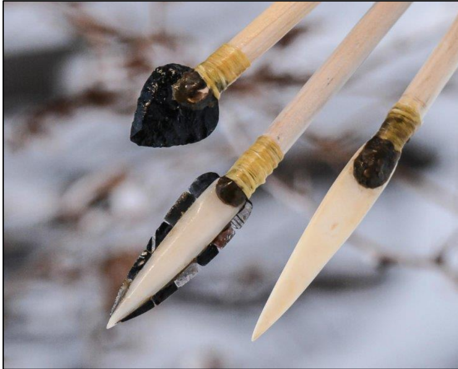
Reconstructing an ancient lethal weapon