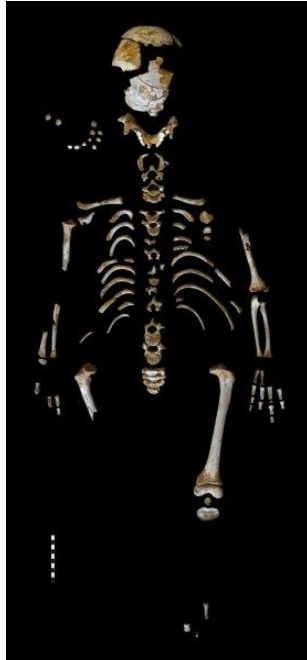
Reconstructing how Neanderthals grew, based on an El Sidrón child