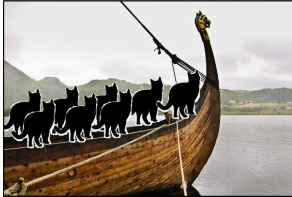
Viking sailors took their cats with them