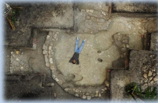
Archaeologists discover Maya 'melting pot'

http://www.uvic.ca/socialsciences/anthropology/