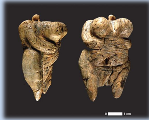
"Venus" of Hohle Fels: lateral and front views

http://www.uvic.ca/socialsciences/anthropology/