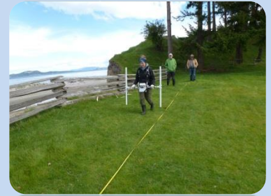
Gulf Island Field School - Summer 2014

You can stay tuned by joining our Facebook page: Uvic Anthropology Student Society: https://www.facebook.com/groups/46351343418/