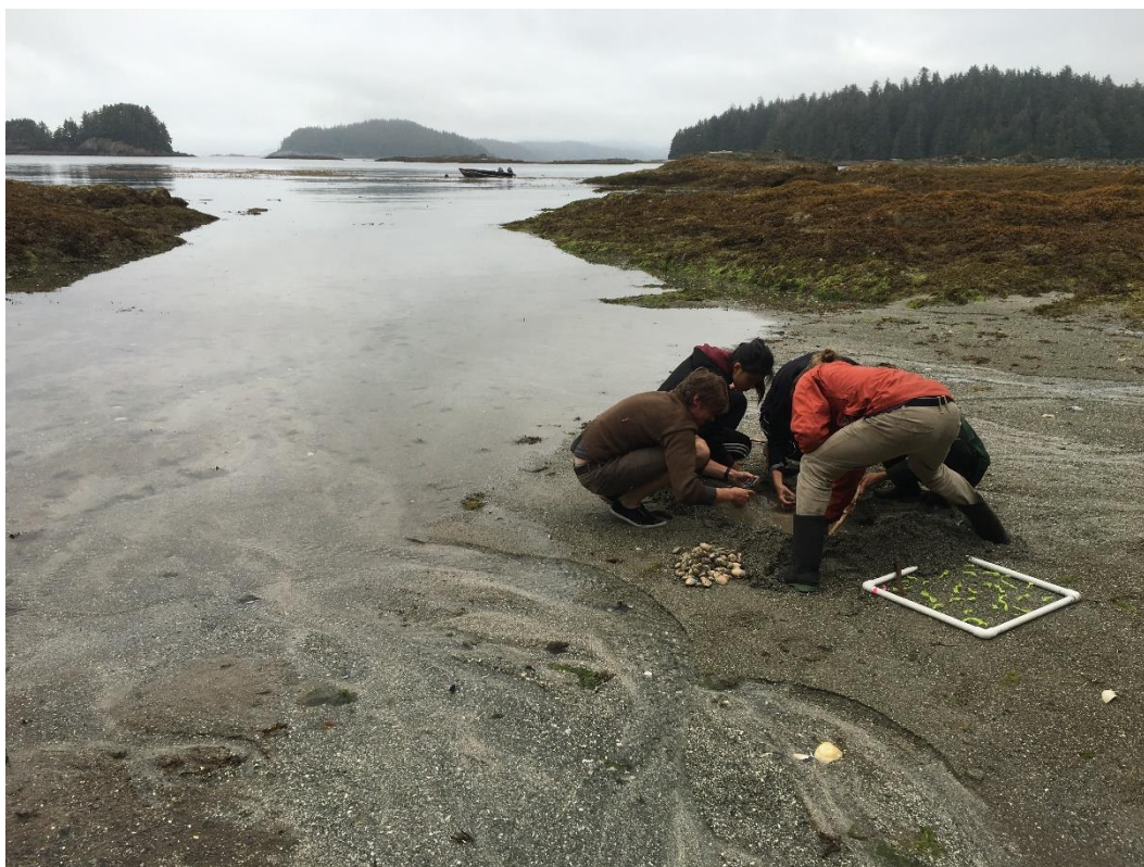
Students sampling the beach in front of a 5,000-year-old village site in Huu-ay-ahnt territory near Bamfield for edible clams.

With best wishes, Ann Stahl , Chair of Anthropology