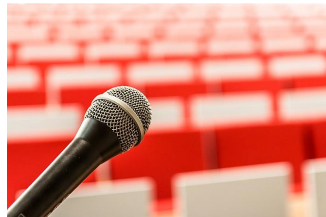
Anthropology Colloquium Series