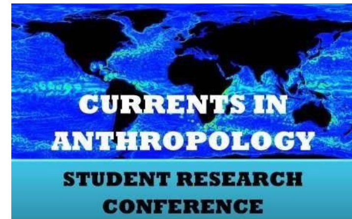
Currents in Anthropology A Student Research Conference Thursday April 4 th , 2019, 10-4