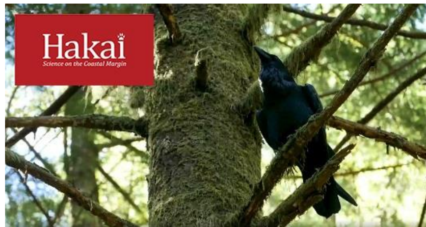
13,000 Years of Coastal Living