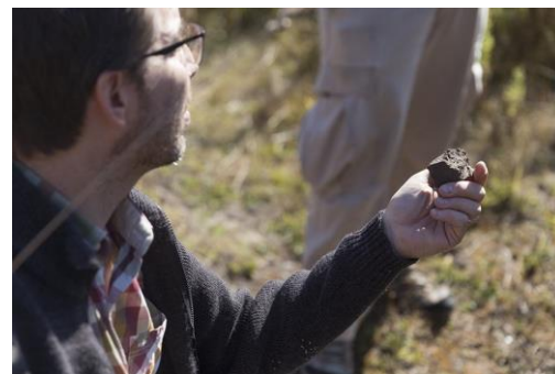
Commemorating Ye'yumnuts project