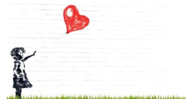
Good-Byes in 2018-19: Happy & Sad