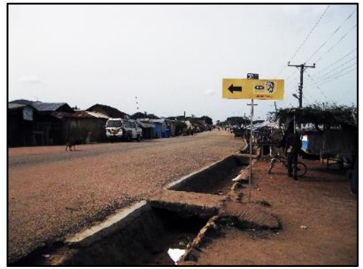
Main Street Banda-Ahenkro, 1982 (left) and 2016 (right)