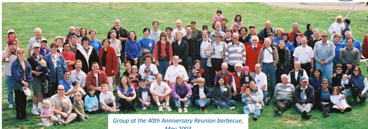
Group at the 40th Anniversary Reunion barbecue, May 2003

The conference part of the weekend will take place on Friday September 28 th with chemis-