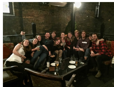
Graduate Biology Symposium Social