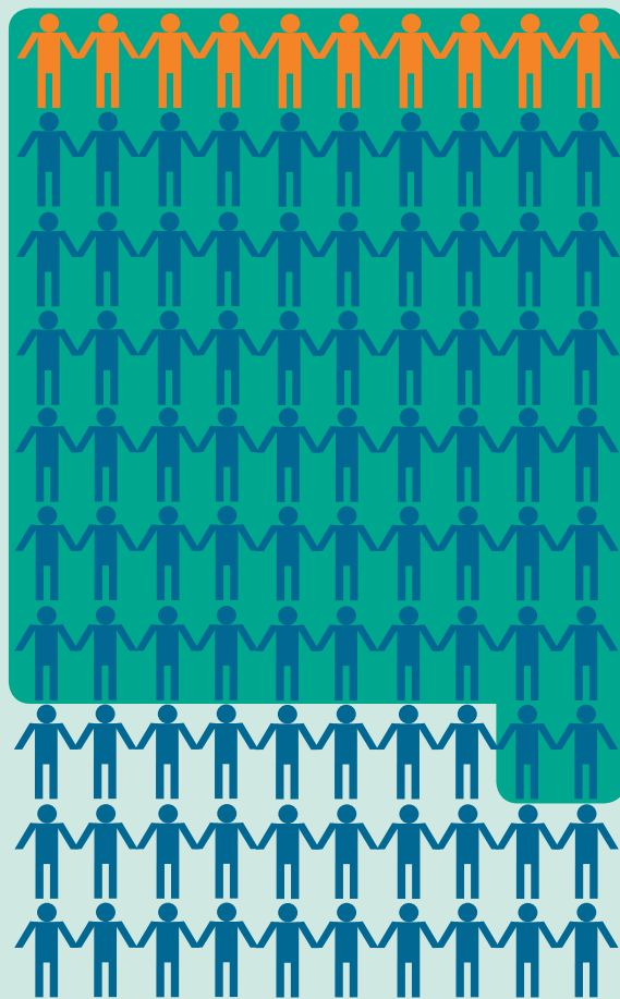
UVic student interest in CER

72% (182) reported not receiving any CER instruction.