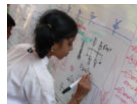
ASSEFA School Mapping School Project Tamil Nadu, India

Utilizing participatory research activities (Triple"A") to address issues of: assessing culturally grounded psychosocial well-being, child centered assessment and evaluation, nature based participatory research tools, culturally grounded research methods