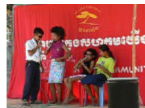
Cambodian Children's Theatre Performance on Trafficking

IICRD in collaboration with Salasan/Geo-spatial and Four Worlds Development has just completed the inception mission on this 6 year, $6 million CIDA funded project focusing on supporting Indigenous children in South East Asia at risk of migration and trafficking in Thailand, Laos, Cambodia, Vietnam, Philippines, Indonesia and East Timor. IICRD will be providing the Child Rights and strengths based/cultural expertise to the project.