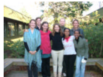
2004/5 Intern Debriefing