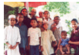
Bangladeshi children and families

for the Government of Bangladesh where she facilitated the process of keeping contact with several actors engaged in the PRSP drafting process to promote children's issues as they relate to the PRSP and produced information sheets on the development of the PRSP and how to make it child sensitive. Overall, while she felt that she developed many new skills, it was the personal learning that was most profound... "It is no surprise that the most important learning that occurred during my stay in Bangladesh were personal. It is impossible to list even a fraction of what I learned there."