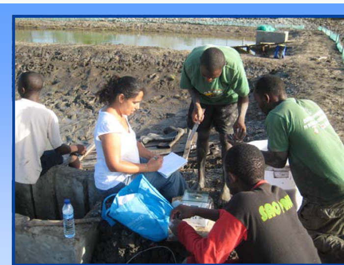
Tilapia team doing the biometry at the ponds

Visit the SOED website for their own annual reports and more information: http://web.uvic.ca/~soed/home