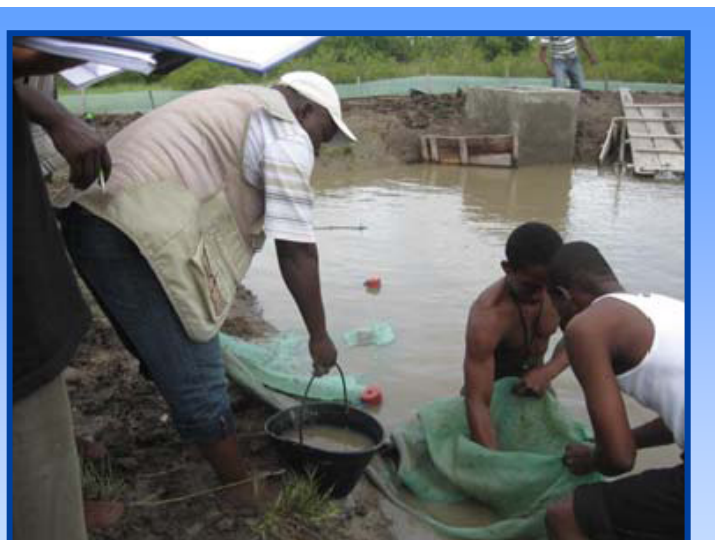
Ponds being used for aquaculture workshop