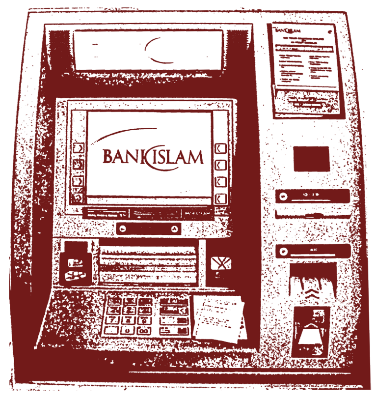
Detail, A Bank Islam ATM in central Kuala Lumpur, December 2015. Photo illustration by Robbyn Lanning; original photo by Daromir Rudnyckyj.

While modern Islamic banks were first established in the 1970s, these were relatively small-scale enterprises that operated on the far fringe of the global financial system. However, by the 2000s financial institutions, nation-states, and international organizations began to aggressively develop Islamic finance, seeking to create a viable alternative to conventional finance. Today Islamic finance is expanding rapidly as states and financial institutions compete to attract the massive volume of surplus capital that has been generated by oil-rich Muslim nations in the Middle East. The Malaysian government has sought to make the country's capital the central node in this emerging global network—what one participant in my research called "the New York of the Muslim world"