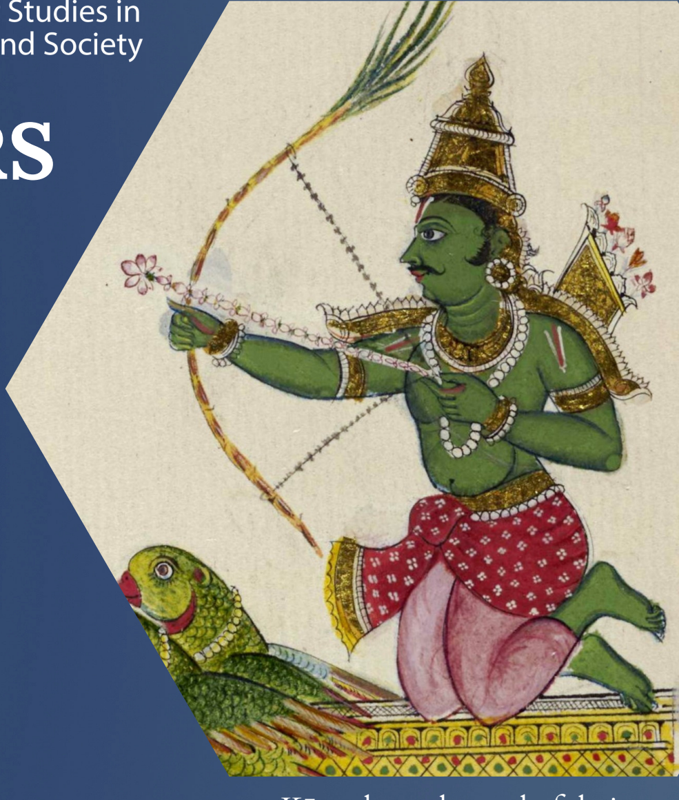
Kāmadeva, the god of desire.