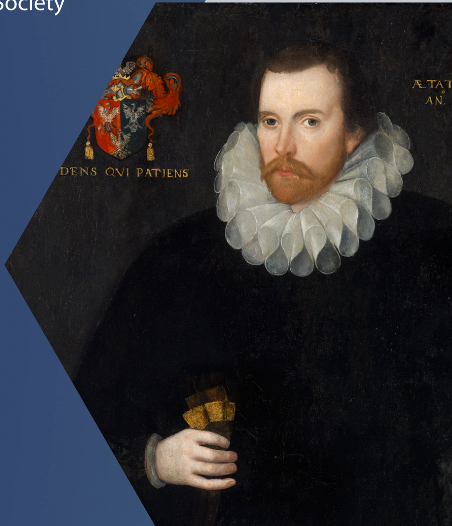
Edward Coke