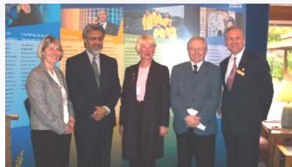
October 15, 2003 Inauguration of the Centre for Addictions Research of BC

Acknowledging the interdisciplinary research strengths at the University of Victoria, the university's strong tradition of community partnerships for research and the expertise housed in the Centre for Youth and Society, the Foundation invited the University of Victoria to develop a proposal for establishment of a Centre. A Memorandum of Understanding between the Foundation and University of Victoria endowed the University with $10 million for the development of the Centre for Addictions Research of British Columbia (CAR-BC), an initiative that is now fostering expertise in substance use and addictions research across the province.