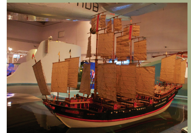
Conference on Chinese Maritime explorer Zheng He, August 2014