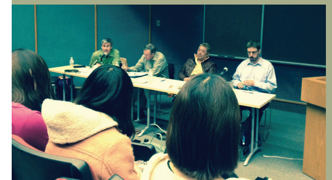
Fallout from Fukushima - panel discussion