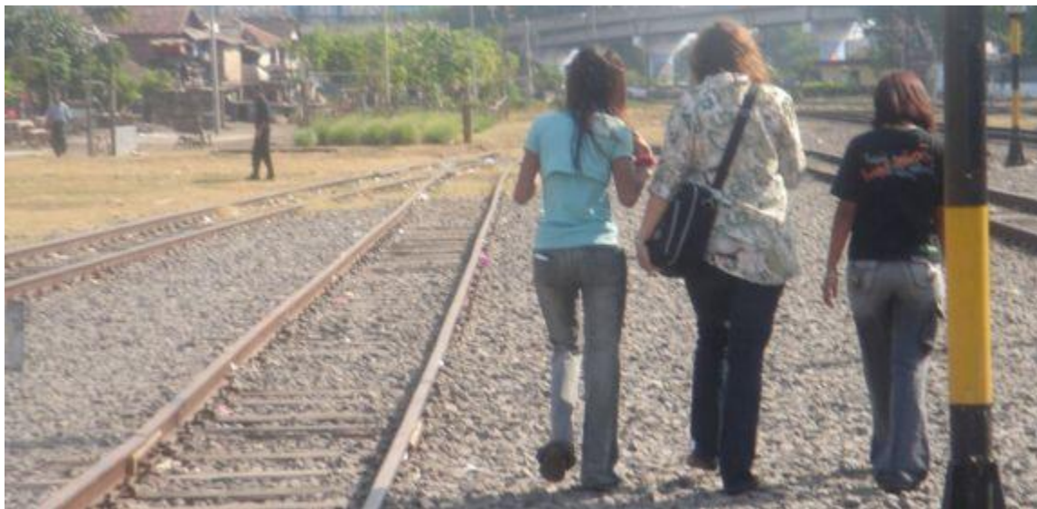
Photo: Wonokromo train station in Surabaya

When Wonokromo station is mentioned in conversation, people would often respond Bahaya! (Dangerous!). At Wonokromo train station female and waria (male to female transvestite) sex workers work under extremely poor and risky conditions. Facilities are limited and typically sex takes place outside on the ground on top of pieces of newspaper. Between customers these women wash themselves near the river before returning to work.