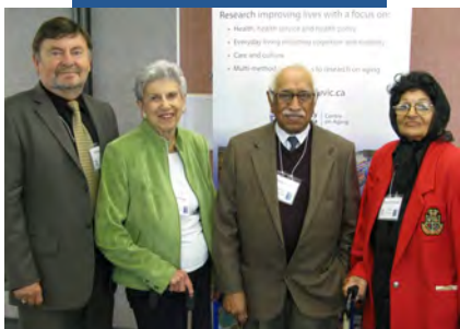
2014 VERA nominees:

The 2015 Valued Elder Recognition Award (VERA) forms are available and ready for your nomination. Please contact Nina Perisic at coagreception@uvic.ca or 250-721-6369.