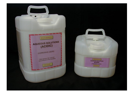
AQUEOUS SOLUTIONS ACIDIC