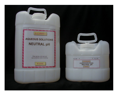
AQUEOUS SOLUTIONS NEUTRAL