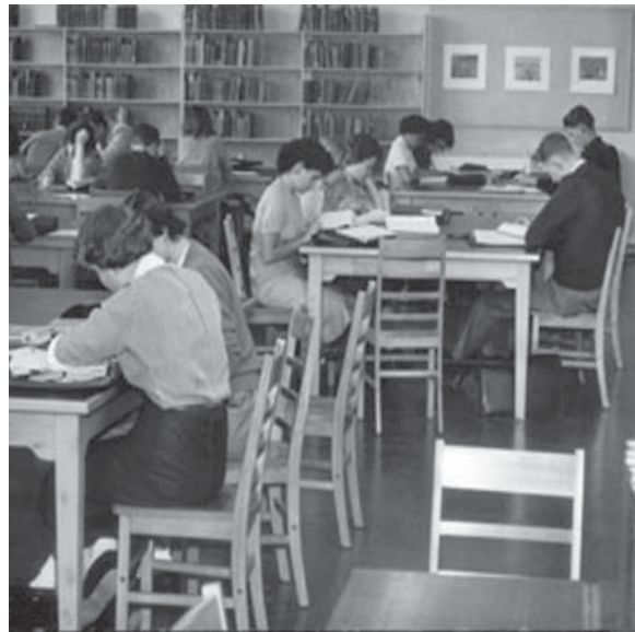
Victoria College, Ewing Building, Lansdowne Campus, presently part of Camosun College. Building exterior circa 1960 and College library interior circa 1954.

Photos courtesy of UVic Archives, reference nos. 008-0623 and 009-1116.