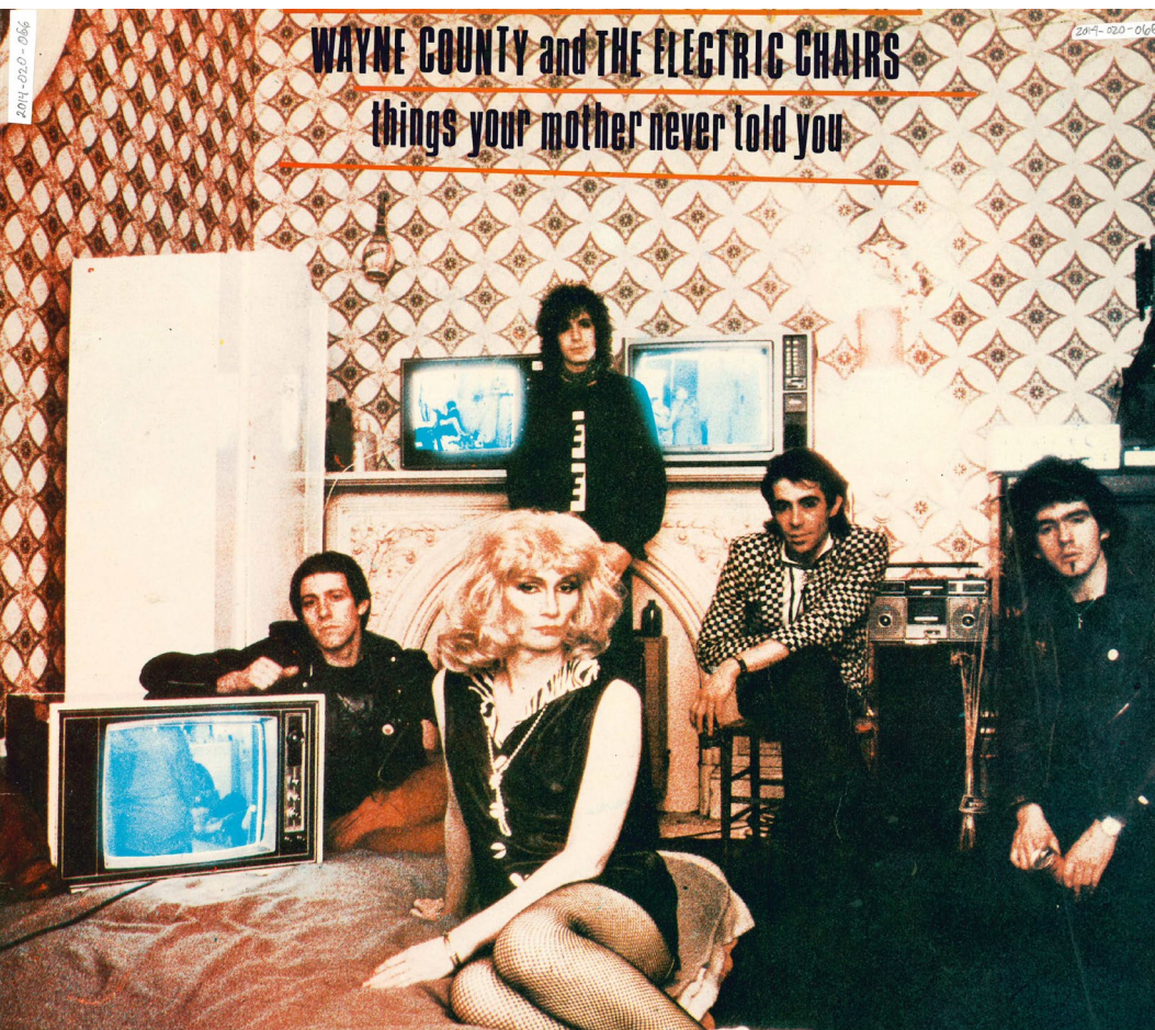
WAYNE COUNTY AND THE ELECTRIC CHAIRS THINGS YOUR MOTHER NEVER TOLD YOU , 1979. LP COVER