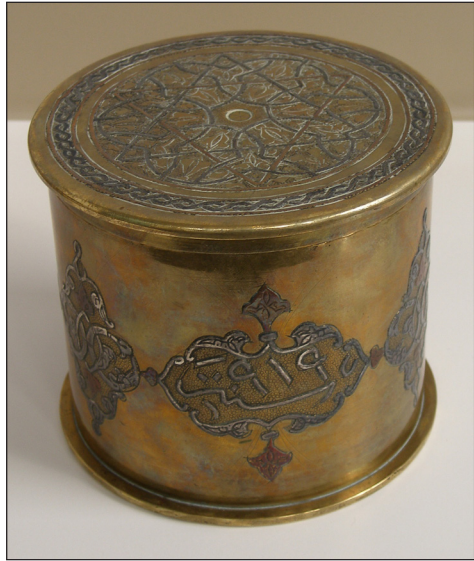
Brass pyxis with silver and copper inlay

(i.e. those areas now occupied by Israel, Jordan, Syria, Lebanon, and the Palestine Authority). The battles in Iraq were primarily fought around the lands of the Tigris and Euphrates rivers (the region known as Mesopotamia). The Ottoman Fourth Army contested these lands with troops drawn from the British Empire, particularly the Indian Expeditionary Force. The Sinai and Palestine campaigns lasted from the Ottoman attack on the Suez canal in 1915 to the signing of the Armistice of Mudros on 30 October 1918. This conflict is perhaps best known for the Arab Revolt and the charismatic figure of T. E. Lawrence (1888-1935, known as 'Lawrence of Arabia').