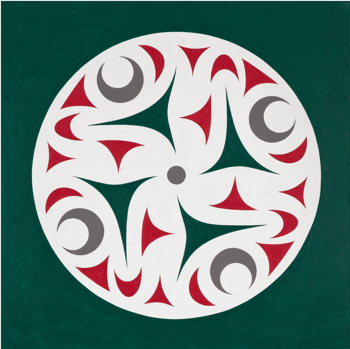
The Moon and the Pond - Dylan Thomas