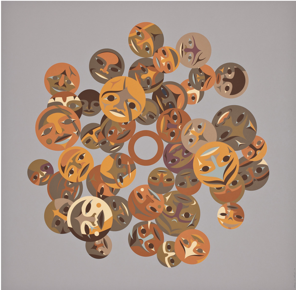
Timeless Circle - Susan A. Point