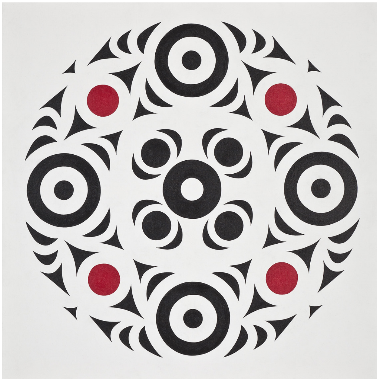
Free Form - Dylan Thomas