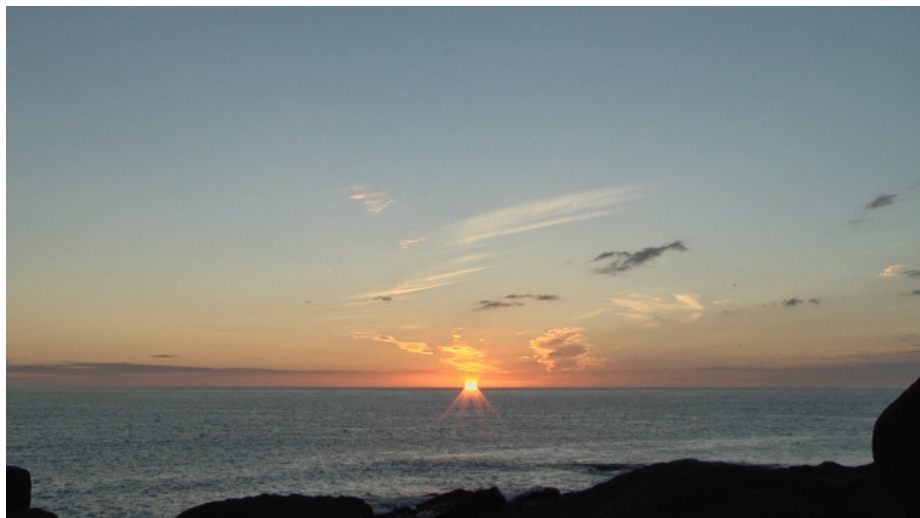
Laura Dutton - Cape Spear