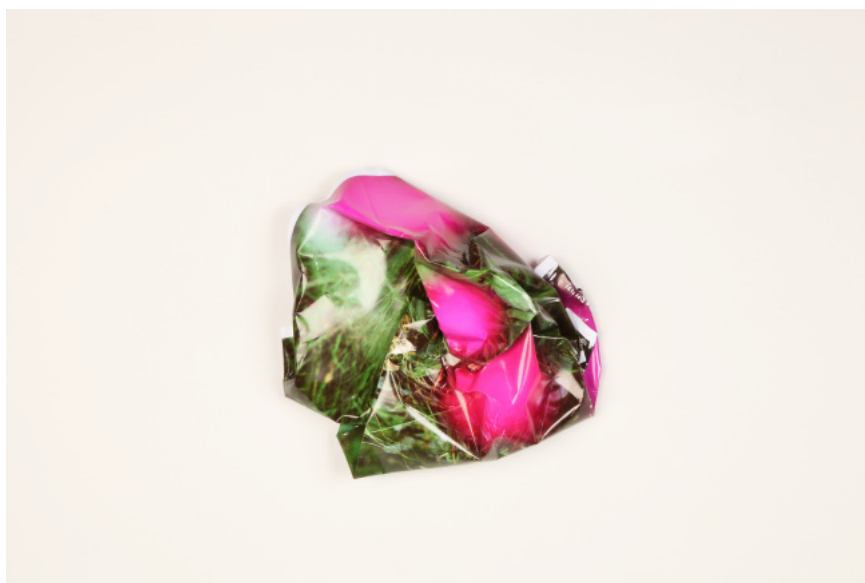
d. bradley muir - The Supernova Scene