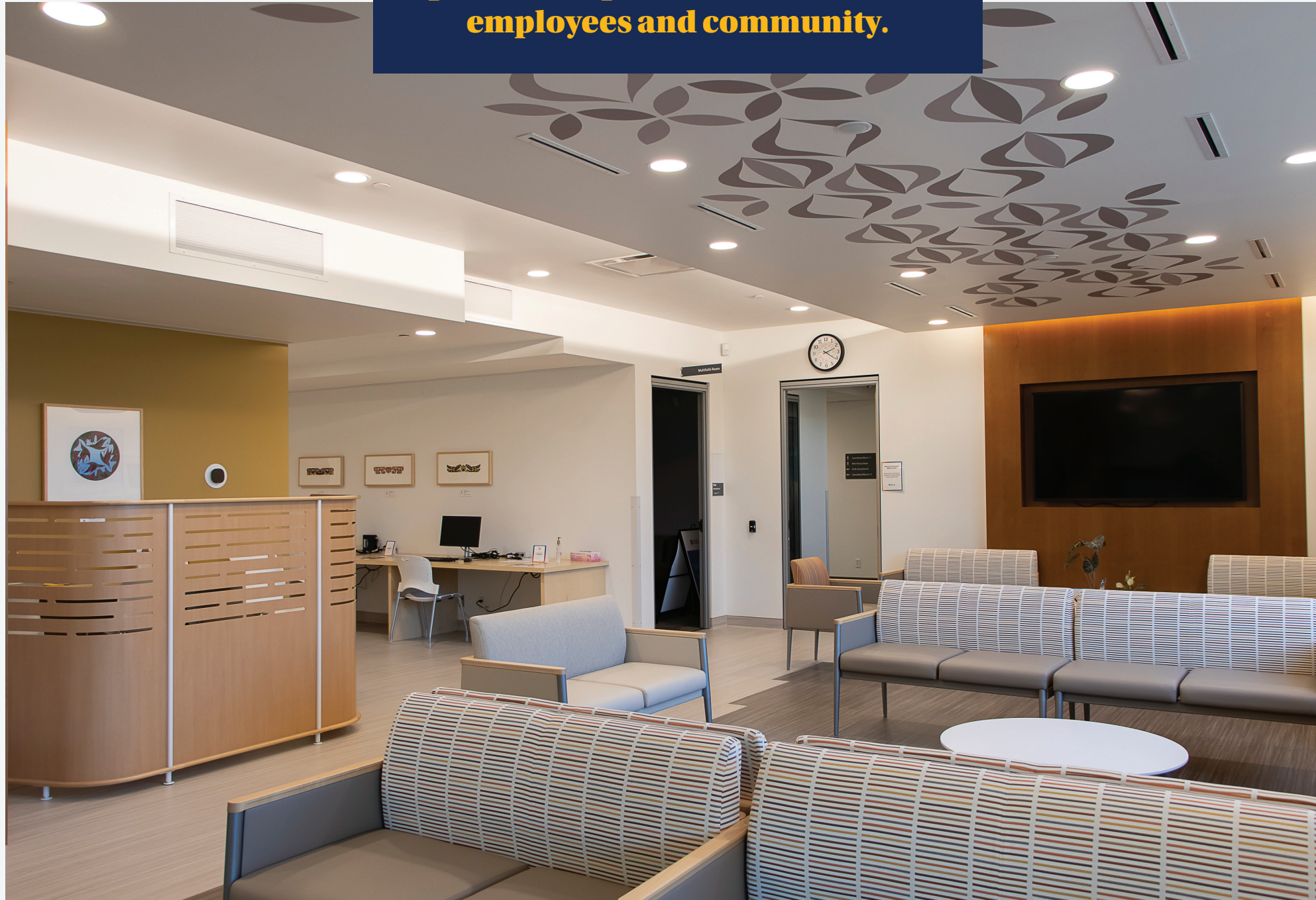
Curated space at Health and Wellness Centre, University of Victoria

The goal of the Art on Campus (AOC) Program is to foster education and provide inspiration for students, employees and community.