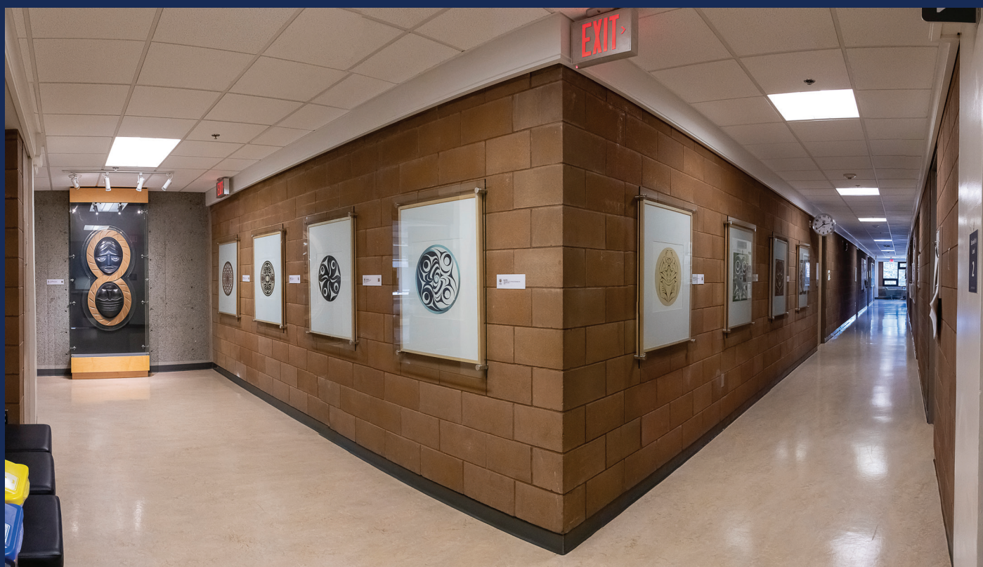
Curated space at Cornett Building, University of Victoria