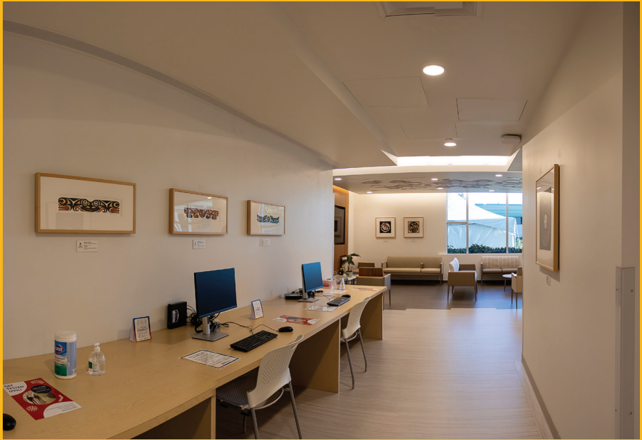
Curated space at Health and Wellness Centre, University of Victoria

Note: Private offices will no longer be eligible for display of art from the permanent collection.