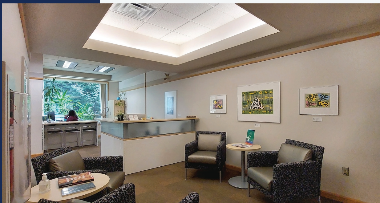
Curated space at Fine Arts Department, University of Victoria

As UVic's professional art museum, the Legacy is responsible for the care and preservation of its permanent collection. Only artwork capable of withstanding non-museum environmental conditions is displayed in public spaces on campus. Other works can be viewed in changing exhibitions at the Legacy Galleries, online, or by request for research and classroom study, ensuring its protection for future generations.