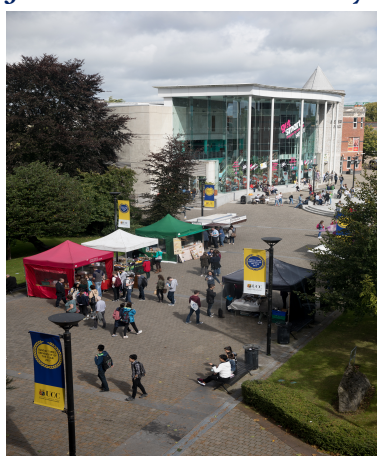
UCC Student Centre