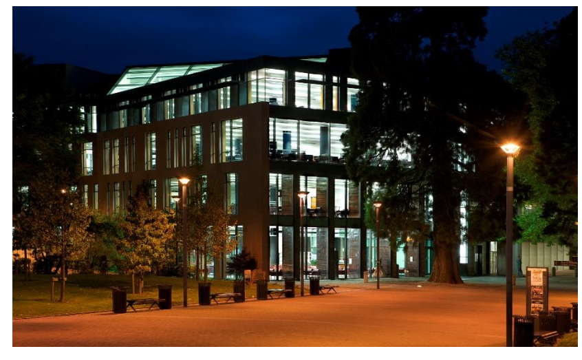
UCC Boole Library

Before you arrive, After you arrive and Living in Ireland