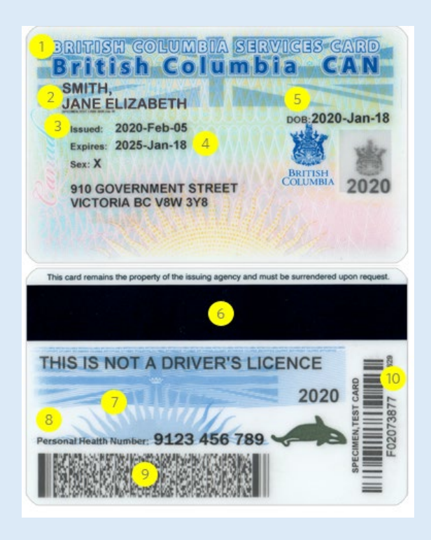
Example of BC Services Card