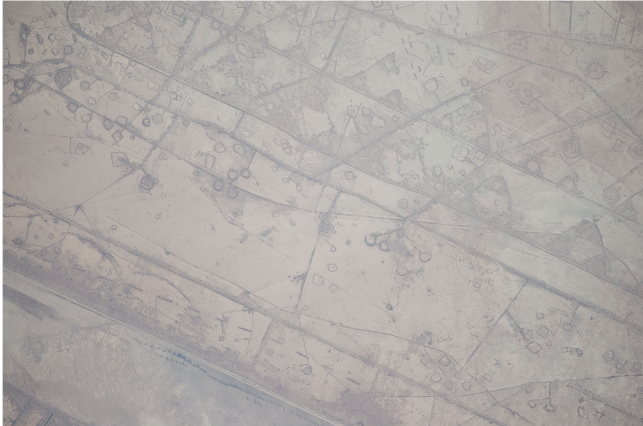
Enhanced satellite image of WWI trenches in a European battlefield (somewhere between French and German lines)