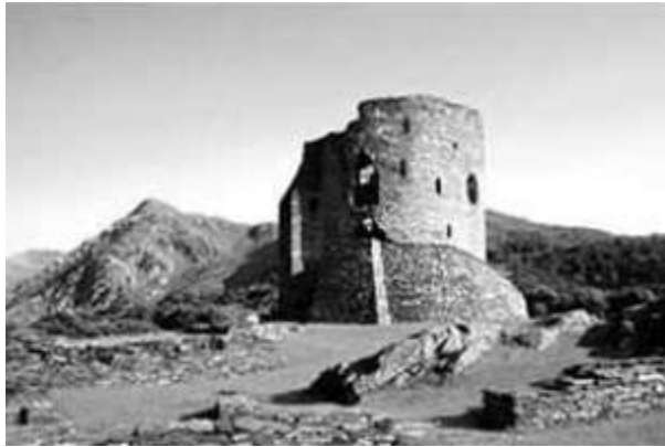
Relics of University of Gondishapur, possibly the world's oldest university, in today's Iran, founded during the Sassanid Empire, 5 th century CE.