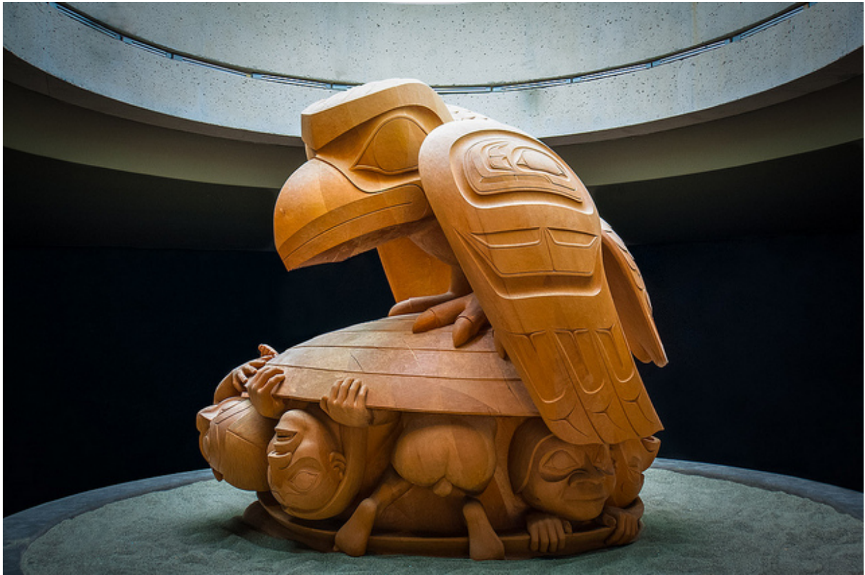
Bill Reid's famous "Raven and First Men," Museum of Anthropology, UBC. It captures the birth of humanity by Raven who tries to coax first peoples out of clamshell found on beach.