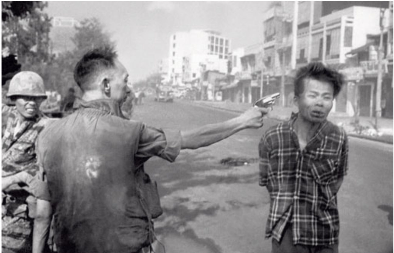
South Vietnamese National Police Chief Brig Gen. Nguyen Ngoc Loan executes a Viet Cong prisoner in Saigon, February 1968. The photograph, by Eddie Adams, won a Pulitzer Prize.