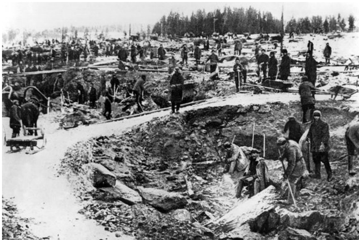
Gulag Magadan, USSR, circa 1929