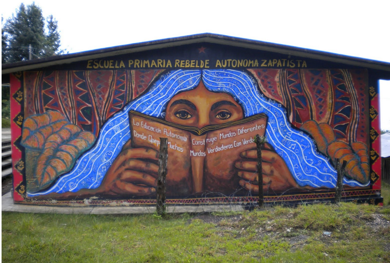
Zapatista Elementary School, in the Autonomous Zapatista Region, Chiapas, Mexico