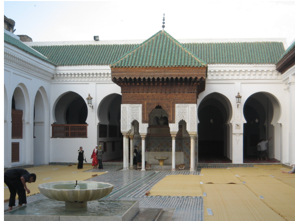
University of Karueein, founded in 859 CE in Fez, Morocco, known to be the longest running university in the world.