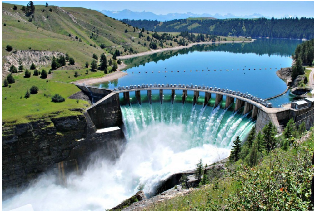
Hydroelectric Dam, Montana, USA