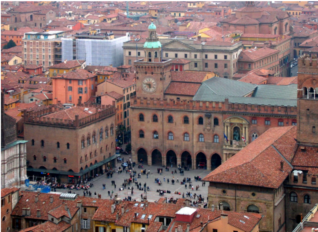
University of Bologna, Italy, founded in 1088, the longest running university in Europe.