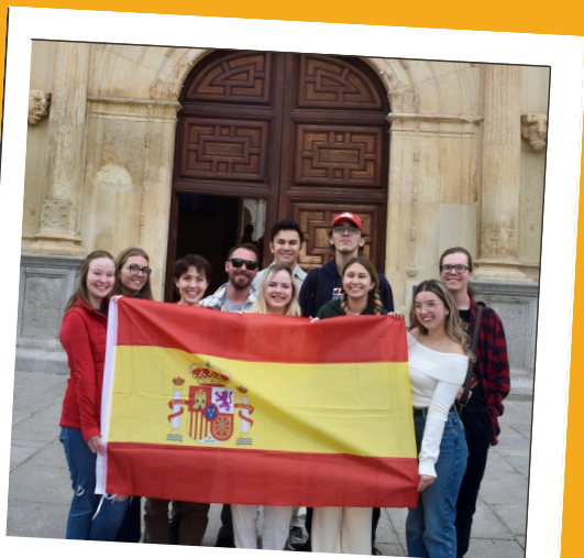
Alcalá de Henares Study Abroad – 2024 Participants

"Studying in Spain has not only given a hyper-boost to my Spanish vocabulary and communication skills, because I am immersed in the language every day, but has also been such an engrossing cultural experience. I've learned so much about Spanish culture, and become enveloped in it myself, not to mention the dozens of other cultures I interact with every day while living in the dorm and studying with students from around the world."