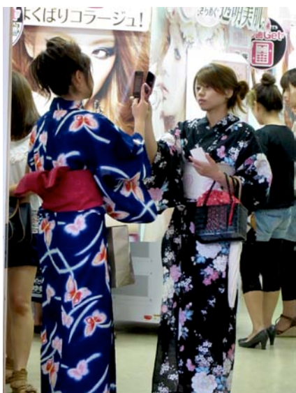
Girls in yukata at a purikura photo booth, Kyoto