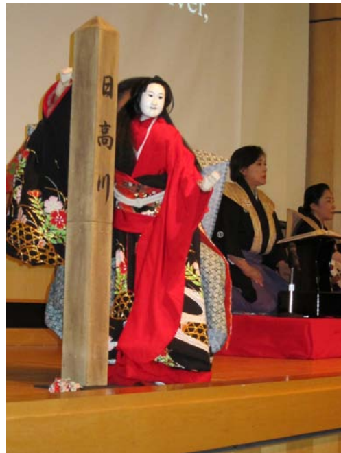
Kuruma Ningyō, traditional puppet theatre from Hachiōji, Japan