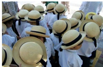
Straw hatted schoolchildren, Kyoto