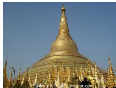
Shwe Dagon Pagoda, Burma

Those were only the formative years of what was to become the Department of Pacific and Asian Studies. You can only imagine how proud I feel to have played a small part in the embryonic stage of what has become an internationally known and respected Department of Pacific and Asian Studies at UVic. Please accept my congratulations and best wishes for continued success.