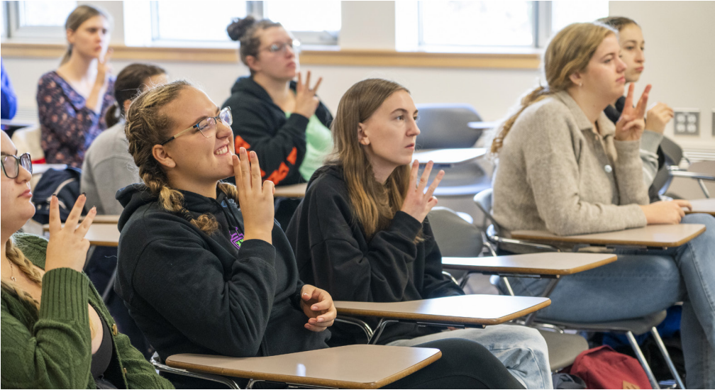
Students practice their vocabulary in ASL 100.