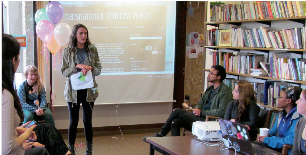
Students and faculty share knowledge about pressing local and global social justice issues in GNDR 100: Gender, Power & Difference.