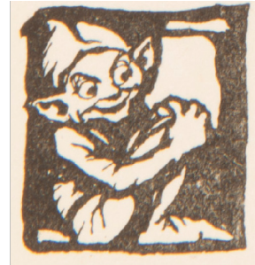
Illustration from the title page of A Midsummer Night's Dream.

English courses develop your ability to write well, to analyze texts effectively and to create your own works. These courses also prepare you for reading and writing in contexts beyond the classroom and university, wherever clear, competent communication is valued. Our department also excels in Digital Humanities, offering a number of exciting courses that bring together literary and digital studies. English students go on to careers in writing and editing, social media management, community outreach, government, libraries and more.