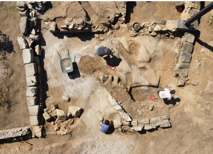
Students get hands-on experience in archaeology excavating in Greece and Spain through the Department of Greek and Roman Studies field schools.