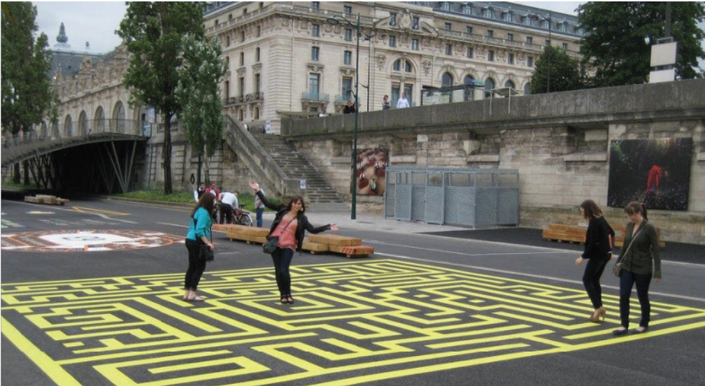
Students navigate Parisian culture in Paris, France, for FRAN360: French Field School Seminar.