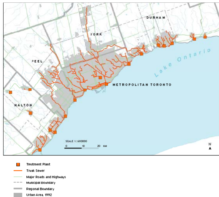
FIG.14 Sanitary Sewage Systems, 1990