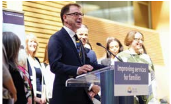
Minister Dix shares announcement at UBC's School of Nursing.

The positions are being supported by approximately $115 million over three years to secure NPs' employment in primary care settings throughout British Columbia. Government is also increasing the number of NP education seats by 66%. Read more at news.gov.bc.ca/releases .