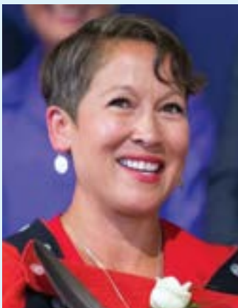
Advanced Education Minister Melanie Mark.

The number of youth who have aged out of government care are pursuing post-secondary education at B.C. colleges and universities like never before. Statistics show enrolment jumped 20 per cent after the NDP government waived tuition fees last fall 2017.