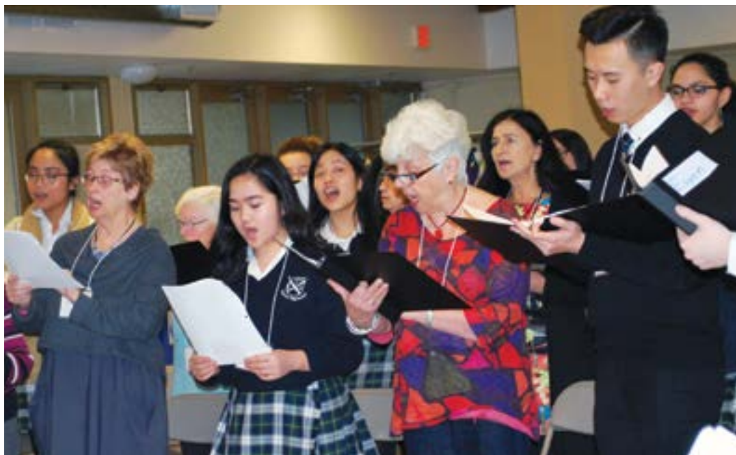
High school students sing alongside those with dementia and their caregivers in a research study.