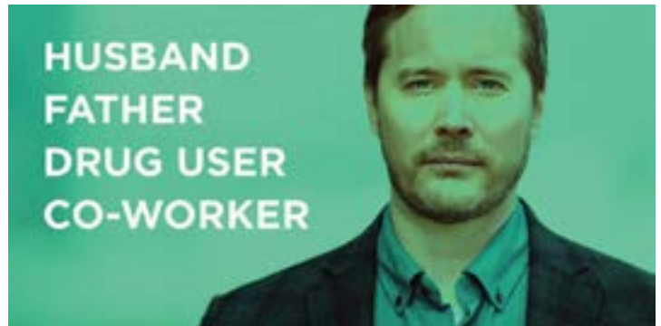
Learn more about government's plan to #StopOverdose